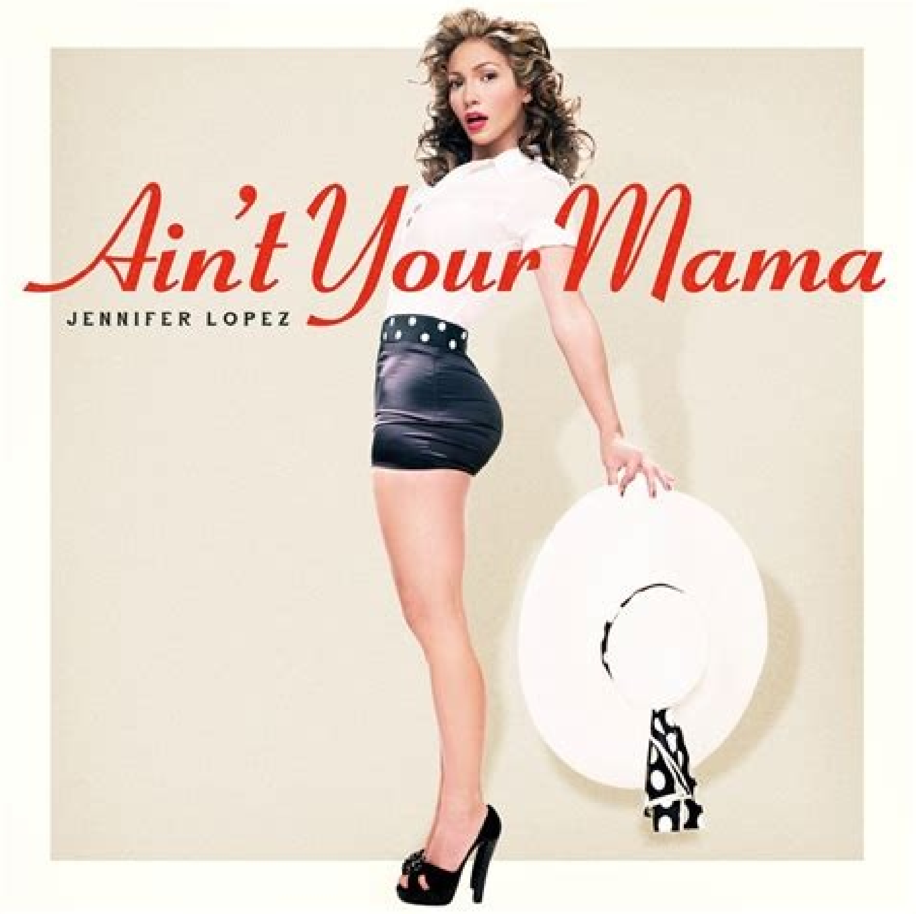
Jennifer lopez aint your mama mp3 song download, Jennifer lopez ain't your mama song lyrics, Jennifer lopez ain't your mama song, Ain't your mama jennifer lopez mp4 song download, Songtext jennifer lopez ain't your mama.